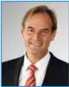
Burkhard Jung Mayor, Leipzig