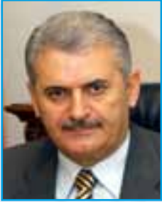
Binali Yıldırım Minister of Transport, Turkey

With the growth of international trade and the globalisation of manufacturing, the international transport system has come under increasing strain to cope with additional demand. These days however, the world is struggling with a deep and drastic economic crisis.