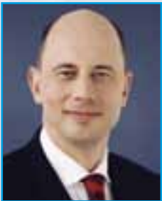
Wolfgang Tiefensee Minister of Transport, Germany

The Forum has already become a unique platform for discussing the major issues related with international transport. Having the Presidency of the second annual meeting, Turkey is confident that the Forum 2009 will provide strong outcomes for maintaining international transport activities fast, efficient and secure enough to keep up with the dynamism of the global economy.