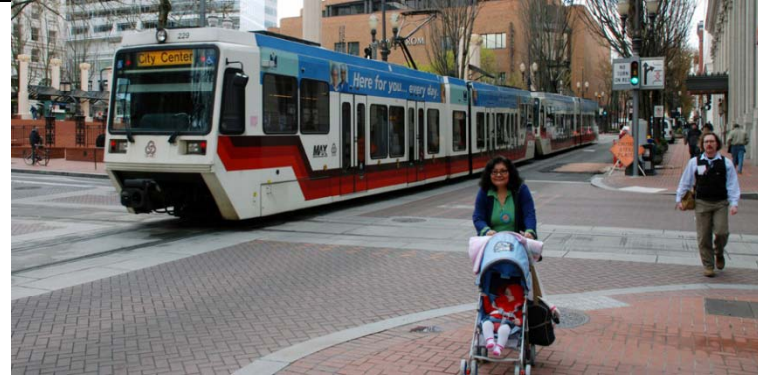
Mother Pushing a Stroller on an Even Surface