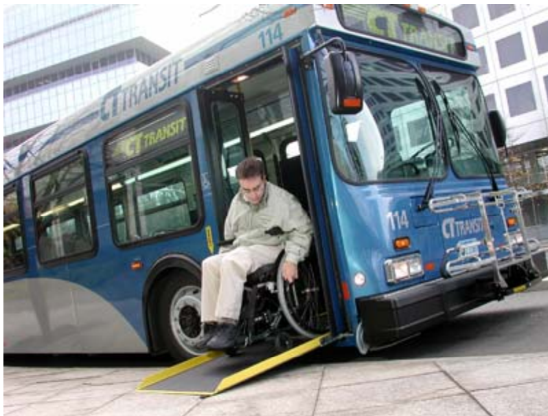
Person with a Disability Exiting a Bus