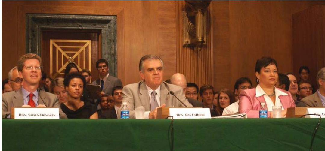
Left to Right: HUD Secretary Shaun Donovan, DOT Secretary Ray LaHood, and EPA Administrator Lisa Jackson