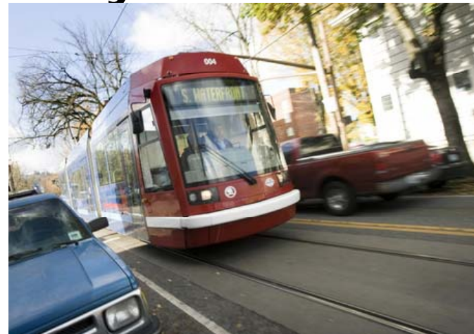
Portland, Oregon Streetcar